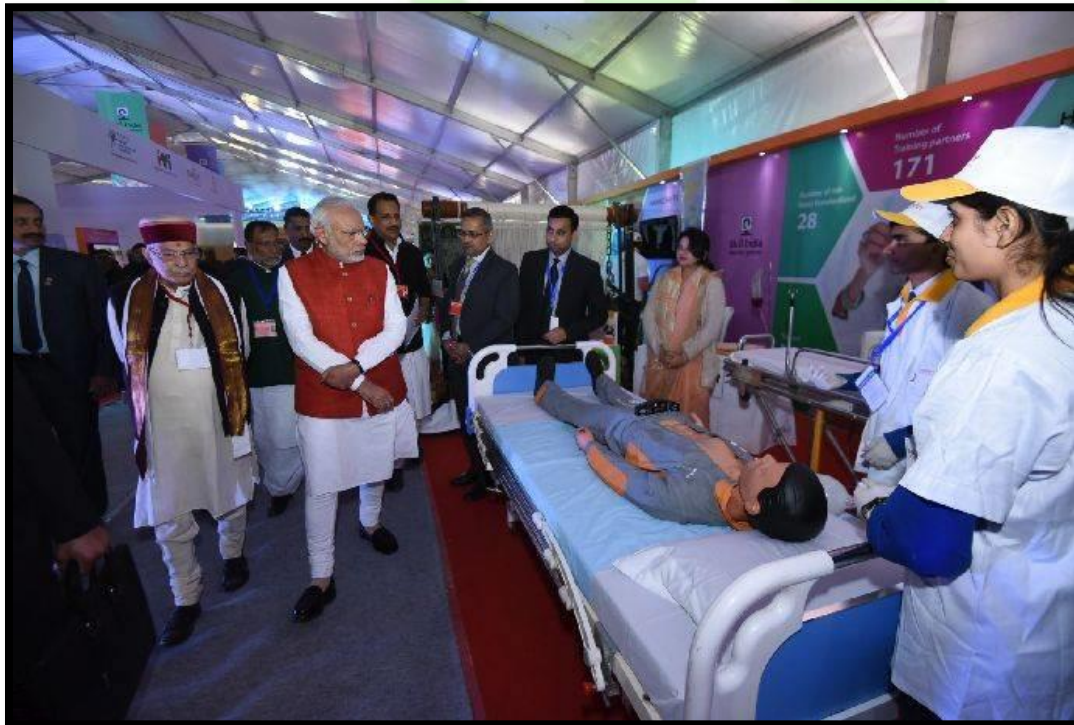
Hon'ble PM Shri Narendra Modi and Hon'ble Minister of MSDE at HSSC stall

Many HSSC affiliated Training Partner like Kulwanti Skills Academy, Vivo Healthcare Pvt Ltd. and Lesante played an important role in successful execution of the event.